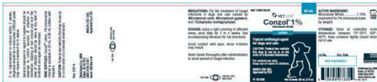
image of 60 mL bottle label - Front panel of wrap around (rev. 0314)