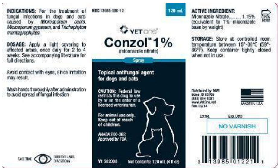
image of 120 mL bottle label - Front panel of wrap around (rev. 0214)