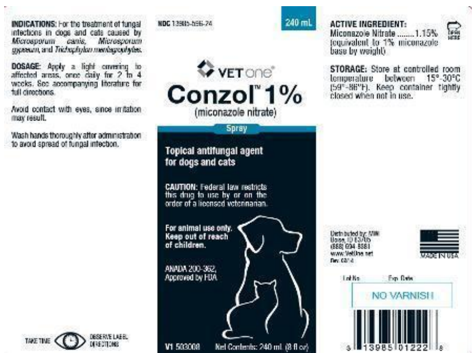
image of 240 mL bottle label - Front panel of wrap around (rev. 0214)