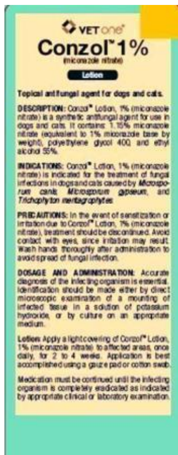
image of 60 mL bottle label - Inside panel of wrap around (rev. 0314)